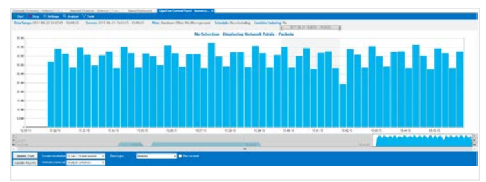
GigaStor reduces troubleshooting time through simplified time-based navigation to anomalous traffic

The undisputed leader in back-in-time analysis, Observer GigaStor™ eliminates the time-consuming task of recreating problems for troubleshooting, or for investigating possible security threats. Go back in time to review past network activity. Navigate to the exact moment of any service anomaly to see detailed, packetlevel views before, during, and after the occurrence. GigaStor packet-based analytics offers robust data intelligence for regulatory compliance, security forensics, and network troubleshooting. GigaStor is available in rack-based and portable form factors or as software for cloud and hybrid IT applications.