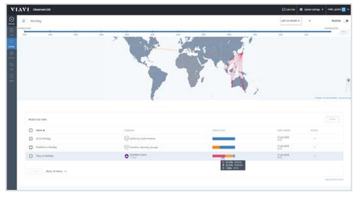
Within the ObserverLIVE dashboard, the LIVE! page summarizes, then prioritizes all marginal and critical conditions by severity for clear visibility into the most pressing issues

ObserverLIVE™ is a SaaS-based offering that complements Observer on-premises monitoring capabilities via ongoing, proactive testing of critical web-based apps, VoIP, and network links. It also solves individual user complaints with on-demand, remote diagnostics. ObserverLIVE detects and streamlines the triage and resolution of user-experience issues in a cloud or hybrid IT environment.