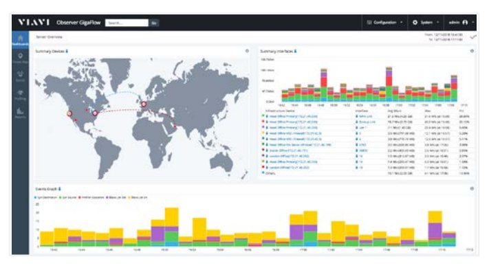
GigaFlow delivers in-depth visibility into the relationship between network traffic and underlying IT infrastructure