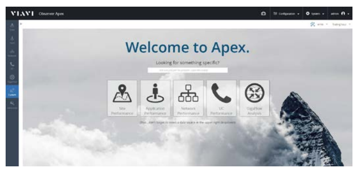
Apex welcome page with powerful search functionality offers predefined workflows